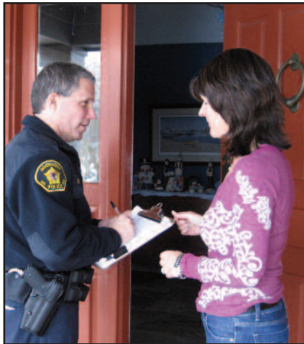
Call 911 immediately to report a suspicious individual. Information from the homeowner is essential in preventing and solving crimes.

In warmer weather, the scenario changes to giving the homeowner a reason to go outside with the burglar. The burglar rings the doorbell (continued on page 3)