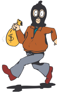
Don't let a con artist rob you of your money

The Inverness Police Department encourages our citizens to hang up on these thieves and to ignore their letters and emails. Please do not hesitate to contact the Police Department at (847) 358-7766, if you are tempted by these plots and need some support or further information in order to say "NO."